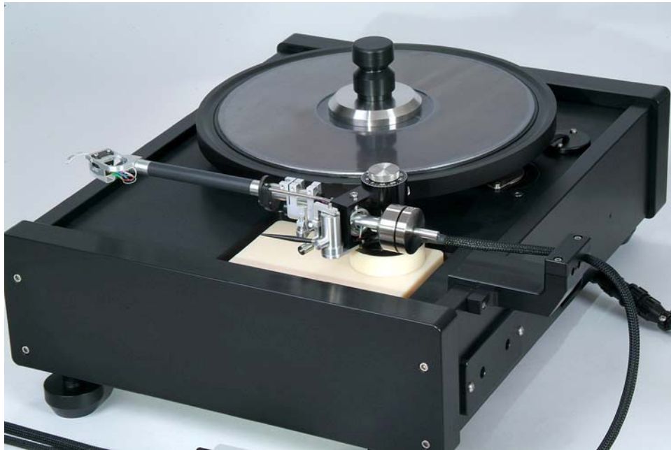
Figure 3 – Cable Strain System

The tuning weight as shown in fig. 4 is already mounted. The slotted end of the weight should be facing towards the tone arm and slid approximately half way to the end of the slot.