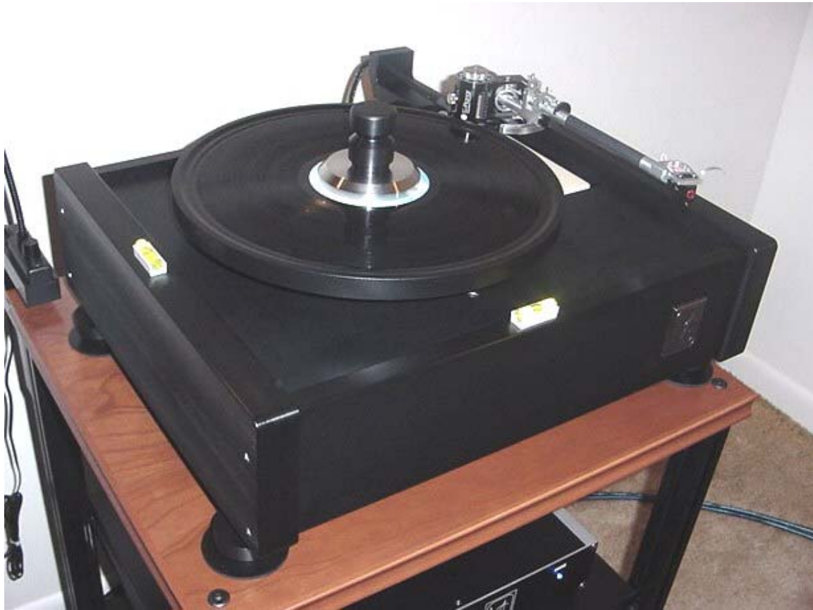
Figure 2 - Leveling

operation again. But once the table is set in its final resting place, you may want to double check and make minor adjustments as necessary.